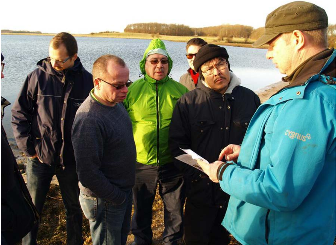
The delegation from Greenland visited Roskilde Fjord